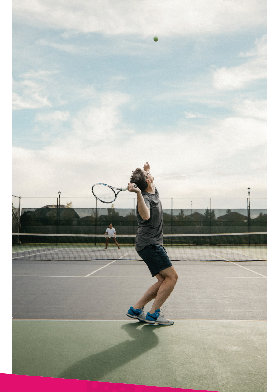
feel connected to their neighbours and community

have participated in community events, programs and activities